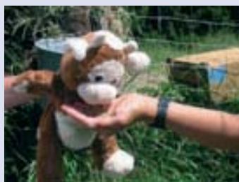
'Samson' inspires the children's imagination

Pupils are enthusiastic about the chance to use computers during lessons, since it has added an interesting aspect to daily school life. New teaching concepts support them in developing initiatives independently, and to improve their ability to express themselves and their media competence. Local authorities have realised that the activity is beneficial for the region and they therefore strongly support the school network. Motivating the teaching staff nevertheless proves more difficult. Not all the teaching staff in the school network take part, since the use of new media has not been made an obligatory part of the annual curriculum. The fact that teachers are free to decide whether to participate in the project requires significant efforts by project management to motivate them in becoming involved. The elementary school of Burggen was the first one to develop an internal curriculum for 'New media' ( www.grundschuleburggen.de ).