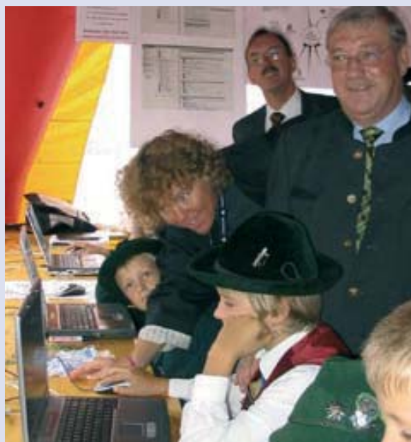
School children learn about some of the project's more technical aspects

As the project continues, 20 teachers together with 18 classes from 11 schools are using the school network during lessons, as well as for networking between the schools. This has led to the creation of 11 school websites, a central